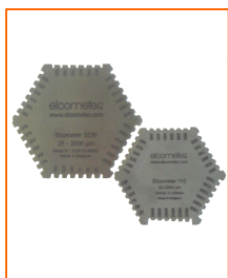
Elcometer 112 & 3236

These stainless steel combs are wire eroded to provide an accuracy of \pm 2.5\mu\text{m} (0.01mil) and are supplied with either Metric or Imperial measurements.