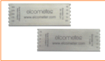
Elcometer 115 Wet Film Combs

These reusable precision stainless steel combs are made to be long lasting and are supplied with either Metric or Imperial measurements.