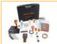
Elcometer Inspection Kits

The new version of the Elcometer 456 now benefits from a larger display for easy data viewing and a simple calibration feature to make testing even quicker. The Elcometer 456 also features Bluetooth® wireless technology for fast data transfer to ElcoMaster™ Software, ideal for easy report generation and archiving of readings.