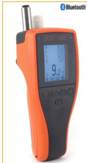
Elcometer 319 Dewpoint Meter with Bluetooth ®†